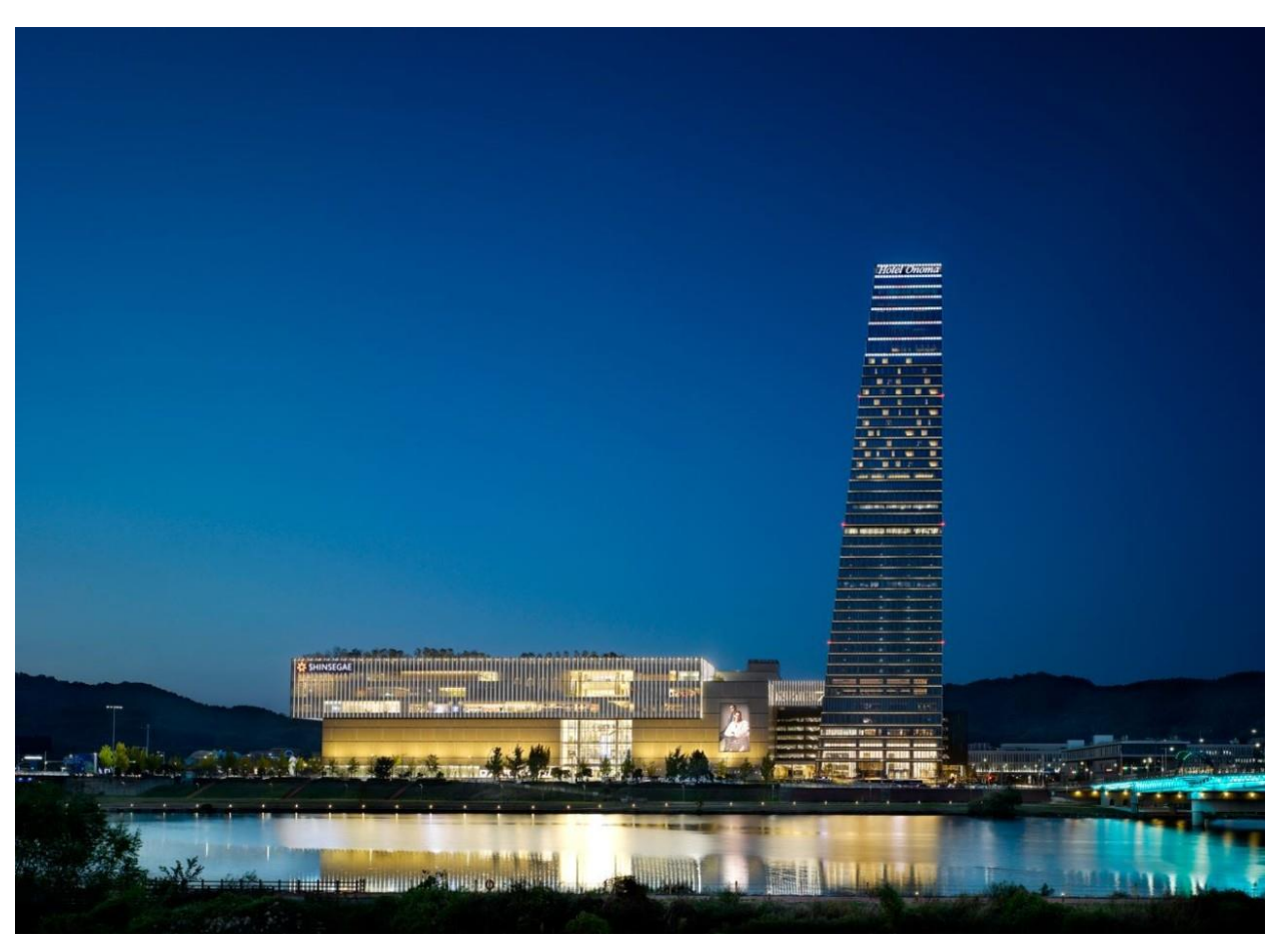
March 7-9, 2025 Hotel Onoma in Daejeon, Korea

Team B: Elucidation of fundamental mechanisms of cellular senescence targeting age-related pathology