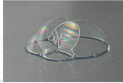
multi-bubble on a plane

We call the edge of the set which touches another object is called the junction. On the junction part, energy is expected to be concentrated and is an interesting target for analysis. We will assume interaction between objects are friction and adherence. Moreover, we can set global constraint conditions such as volume conservation, potential energy by the gravity. In this setting, variational methods works better than differential equation treatment. We will apply this for hyperbolic problems.